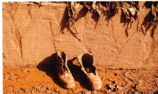
Ten people were killed and thousands lost everything in the disaster. Schoolchildren wear masks against dust from dried toxic mud in Devecser.